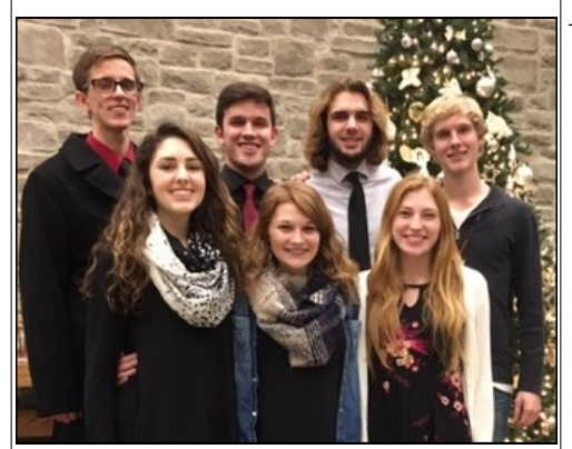
Solid Rock youth who participated in the 11:00 Christmas Eve service

Please leave your items in the wooden boxes in the narthex.