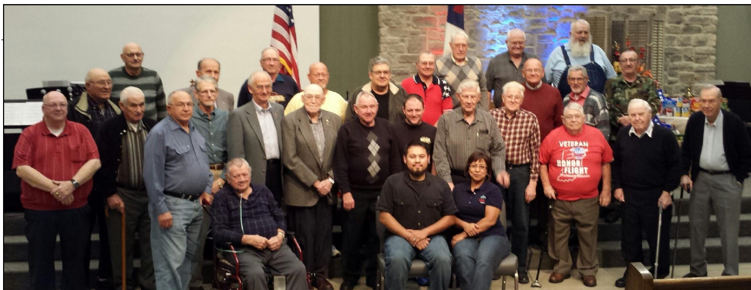
Solid Rock honored these veterans with a dinner and program on November 15.

—Adapted from Growing Strong in the Seasons of Life